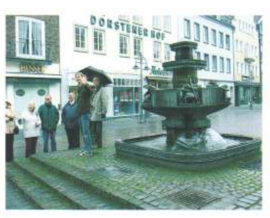
Dorsten - the 'Story' fountain