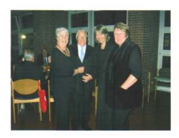
Old friends meet again in Dorsten