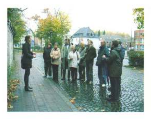
Old Dorsten centre walk