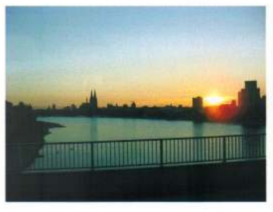
Journey home - crossing the Rhine at Cologne