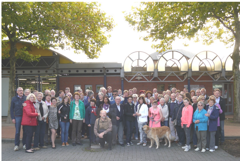
Goodbye Dorsten and Aufwiedersehen till next year in Crawley