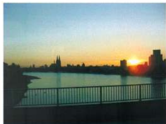
Journey home - crossing the Rhine at Cologne