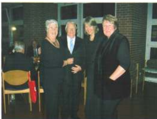
Old friends meet again in Dorsten