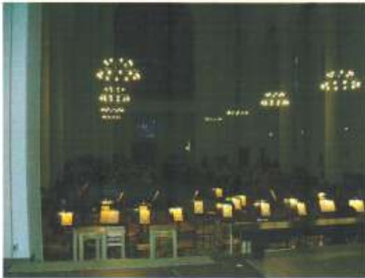
St. Agatha's Church, Dorsten