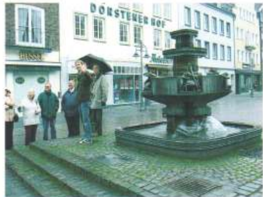
Dorsten - the 'Story' fountain