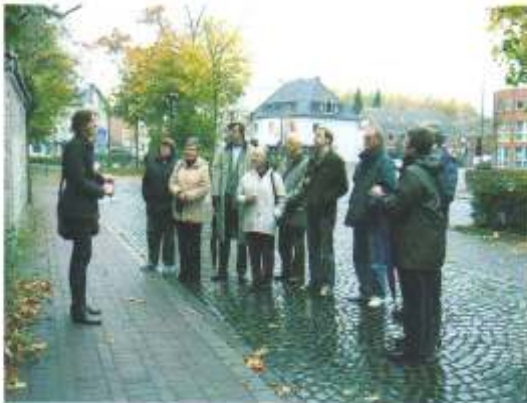
Old Dorsten centre walk