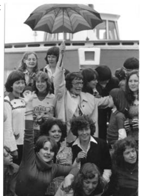
Dorsten June 1976