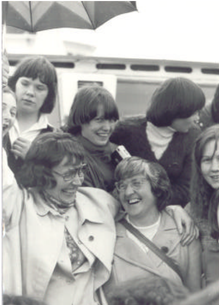
Dorsten June 1976